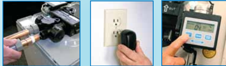
1. Connect to plumbing. 2. Plug in transformer. 3. Set the controller.